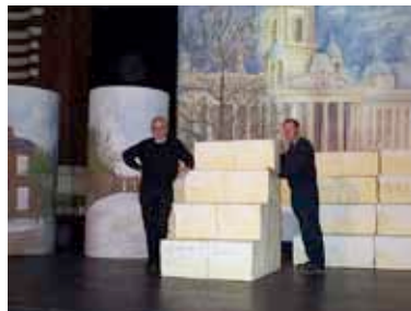
One Pride set