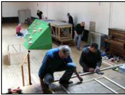
Alice in Wonderland construction