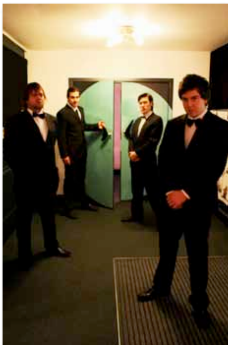
The show is not recommended for under 14's