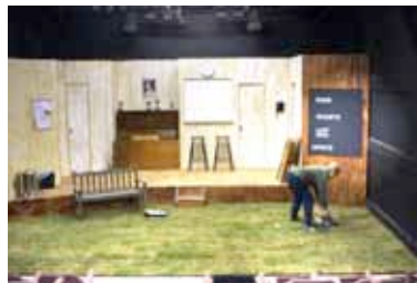
Outside Edge set c/w real grass

It's a great way to meet others in Dynamo and it does provide a real sense of achievement as you start to see yet another set take shape. But the best thing, of course, is watching a Dynamo production knowing you've helped it along the way.